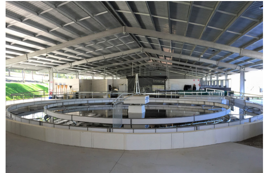
Horse Equine Centre